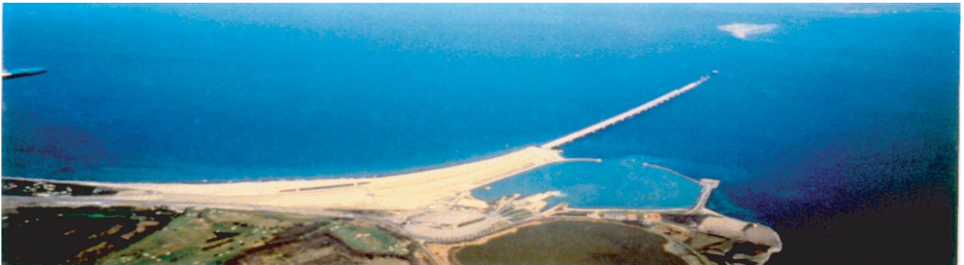
KNUDSHOVED: Land reclamation – West Bridge